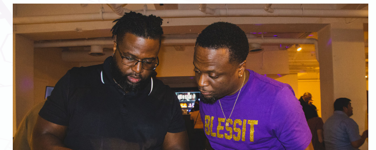
Volunteers getting involved at NGP's Collard Greens + Cornbread signature event.