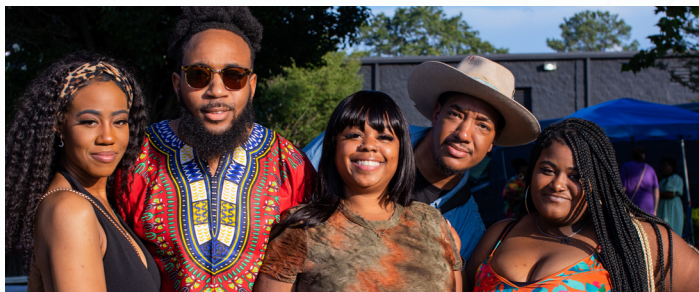
Georgia voters showing out for NGP at a community event in Atlanta.